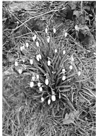
Snowdrops – beside roots of removed tree opposite 12 Cleveland Road, 21 st

As the different varieties bulbs come out at different times, BulbWatch is something you, your friends and family can do all Spring long. Just don't keep the knowledge to yourselves – share it with us by writing an email or sending your photos to blakerspark@hotmail.co.uk